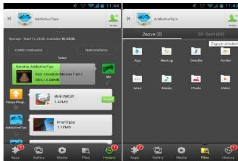
Fig.4 Zapyra view

Once a sharing session is initiated, you can keep transferring content to required recipient's devices without worrying about being prompted about pairing over and over again. The iOS variant of Zapyra has been around for a while, whereas the Android app has just found its way to Google Play Store. Besides being a user-friendly file sharing app, Zapyra happens to be a handy file and app manager that allows launching, deleting, uninstalling, renaming, backing up and checking properties of your desired content. For all your data transfers, the app maintains a detailed log regarding the type of data, the time of sharing, the recipient(s), and the breakdown of data shared over Wi-Fi network and Hotspot. From the security viewpoint, Zapyra allows you to set a custom connection password and specify a whitelist of trusted Zapyra users.