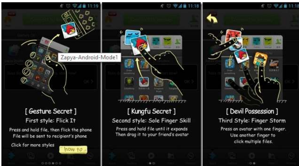
Fig.5 Zapy share data